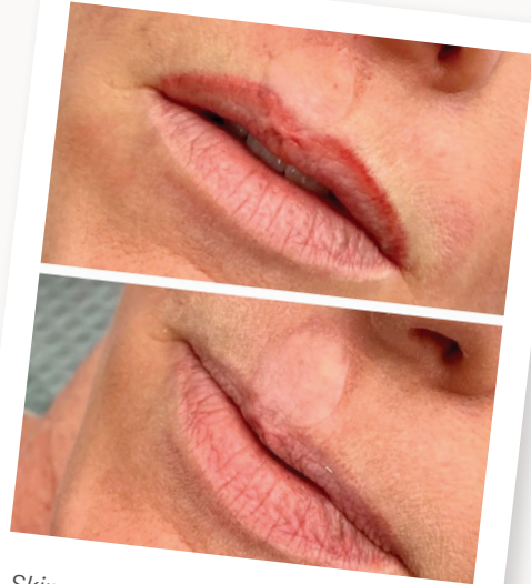
Skin graft camouflage 📱 @cinnamongirltattoo

We provide a FREE service to change your radiation tattoo's into natural looking freckles?