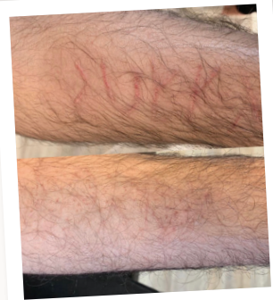
Small Tattoo Saline Removal

Our Saline Removal is for small tattoo removals. If your tired of looking at an old faded tattoo or a big mistake you may have made all those years ago, we can remove it with Saline removal. This procedure usually takes 2 – 4 sessions unlike laser that can require many more visits. The saline solution draws the tattoo out of your skin (Laser pushes the tattoo pigment into the body which then releases it through the body's system). Saline removal is a very effective form of tattoo removal.