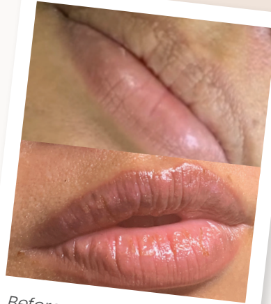
Before and after of our lip blush client

Lip blush is a semi-permanent cosmetic tattoo that enhances the lips natural tint and shape by giving them a boost of blush colour. The outcome is to define your lips by making them look full in a very natural way. We start with an initial session for the lip blush and finish it off with a perfection visit after 6 weeks. This type of treatment can last up to three years.